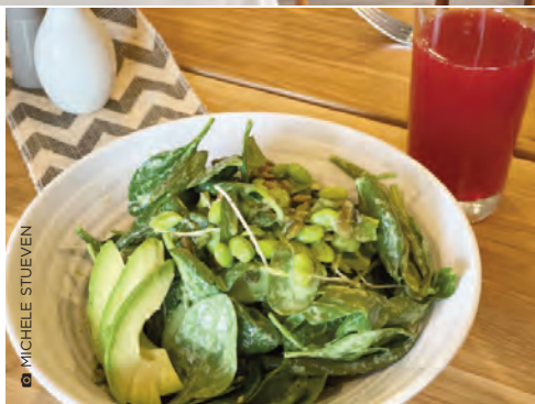
CLOCKWISE FROM TOP LEFT: Azure Palm Cafe seating; 100-foot mineral spring pool; spa suite king + queen; Green Goddess Salad and Beet Juice Cleanse