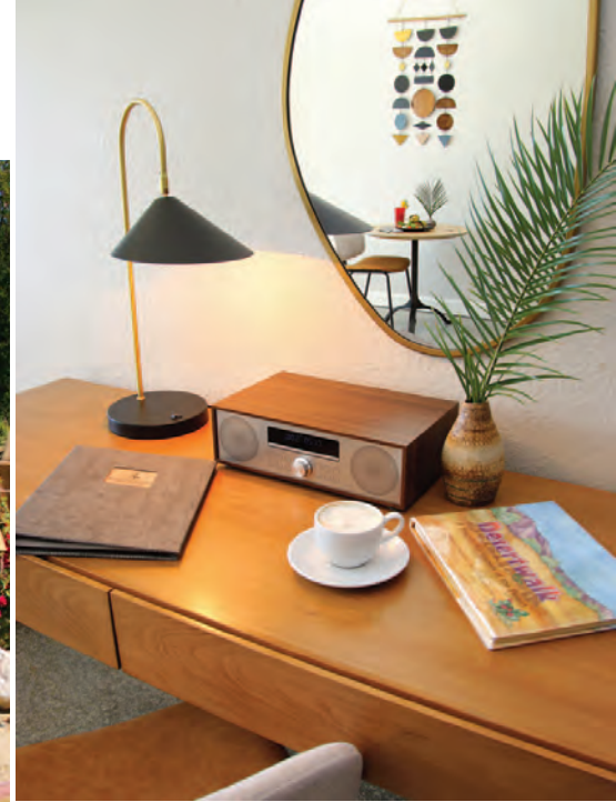
PREVIOUS PAGE Spa suite room with view